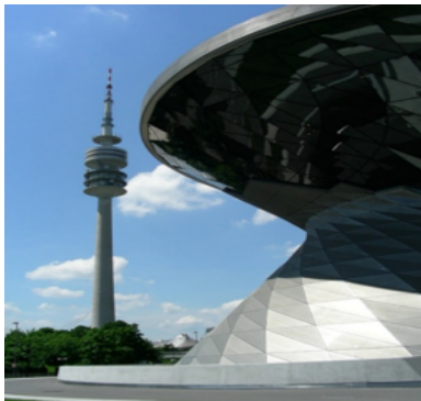
Munich Olympic Tower and BMW World