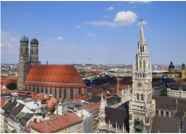
Munich Our Lady's Church and New Town hall tower