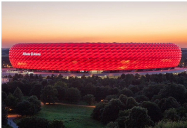
Munich – Allianz Arena