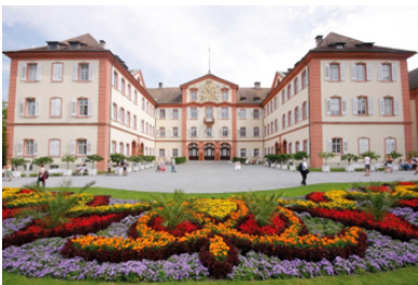
Baroque Mainau Castle