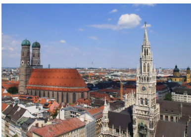
Munich Our Lady's Church and New Town hall tower