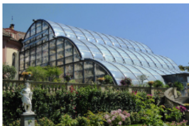
Baroque Mainau Castle