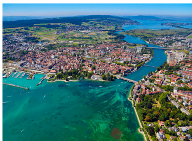
Aerial view of Constance