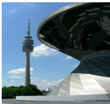
Munich Olympic Tower and BMW World