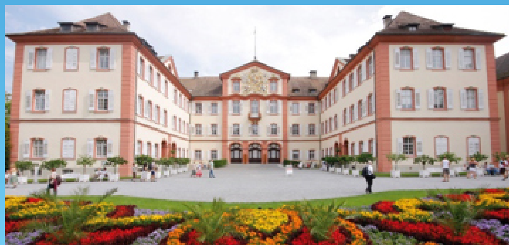
Baroque Mainau Castle

The 45 hectare Mainau Island is located in the proximity of Konstanz just off the shores of the lake. For more than 150 years the old palm house with giant sequoias has been welcoming visitors to enjoy botany. Around a million tulips, rhododendrons, scented roses, perennials and colourful dahlias bloom in the park and gardens. Palms and citrus plants add a Mediterranean flavour to the island in the summer time. Visit the Baroque castle dating back to 1746 and the castle church St. Marien as the architectural highlights of the Baroque era.