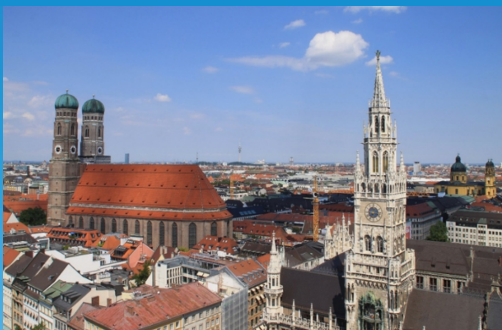
Munich – Our Virgin Mary's Cathedral and town hall

This morning we will enjoy great shopping opportunities in Metzingen, a small town famous of its many designer outlet stores that were initiated by the German fashion designer Hugo Boss. In the afternoon we continue our journey to Munich. Let us enjoy the local atmosphere in a beer garden tonight! (2 nights in Munich)