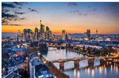
Frankfurt am Main