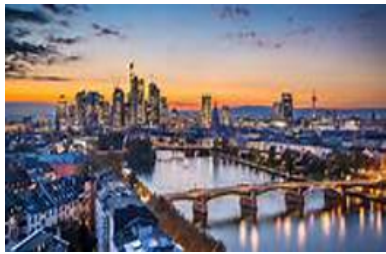
Frankfurt am Main