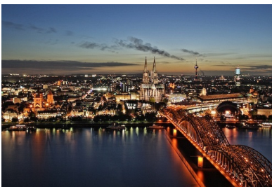
Cologne on the Rhine River