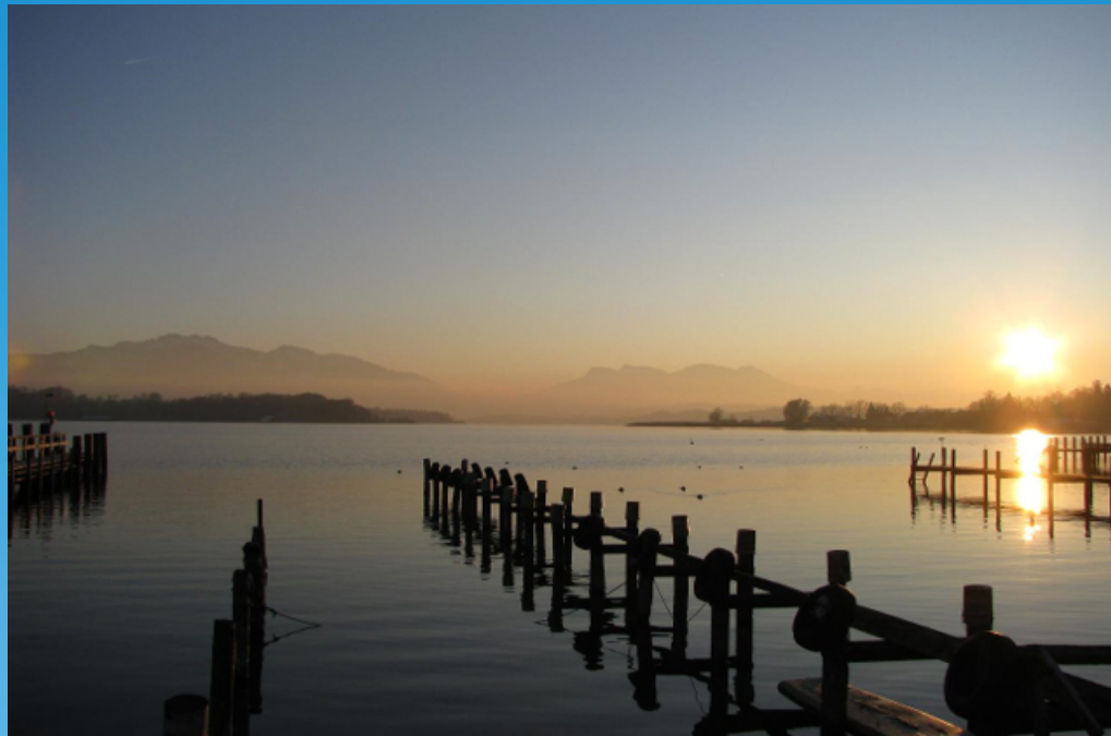
On the shores of Chiemsee

We will reach Chiemsee by a 1,5 hours' drive 110 km east of Munich. Weather conditions allowing you will catch fine views of the marvellous Alpine scenery. Chiemsee is the largest lake in Bavaria and by the locals called the "Bavarian Sea". Optional: Leisurely hike to an Alpine cottage.